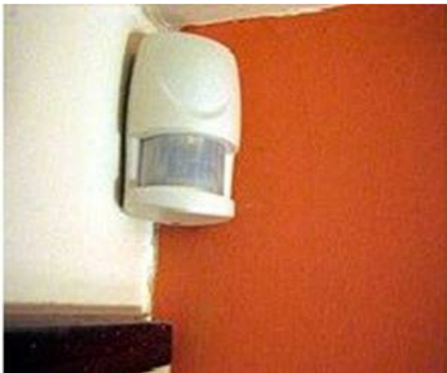
C:\Users\MCS\Desktop\1.jpg Passive Infrared Sensor

These types of sensors are designed for indoor use. Outdoor use would not be advised due to false alarm vulnerability and weather durability. Passive infrared detectors